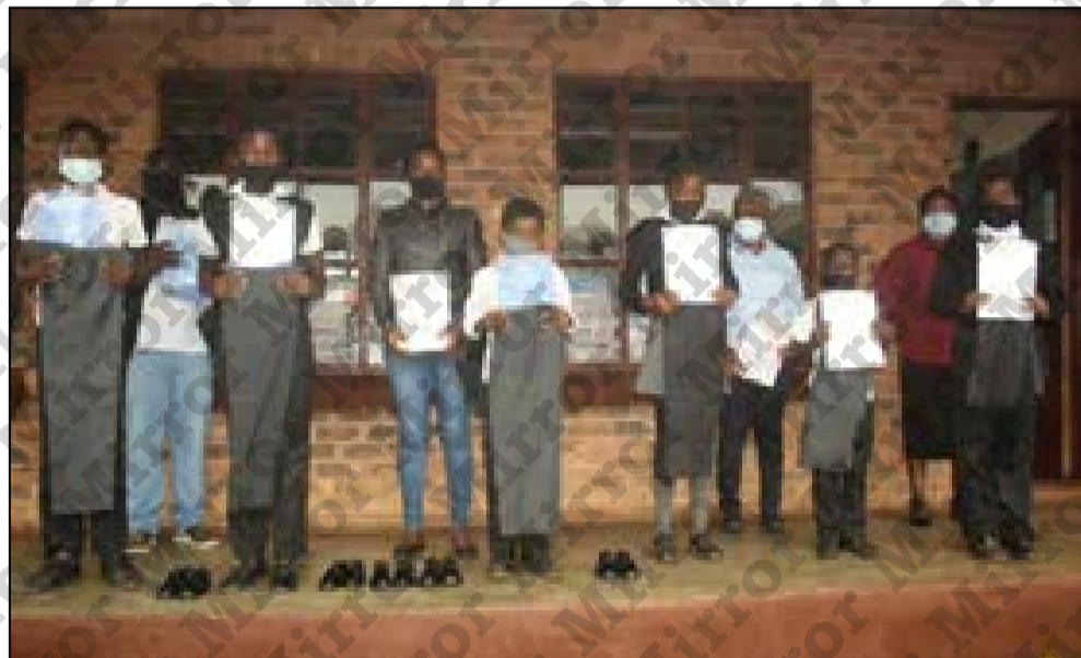
Members of Rotangana Foundation pose for a photo with learners and staff from Mabila Primary School in Mutale.