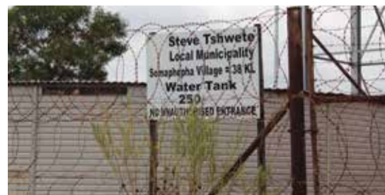
The old water tank supplied the community with water.