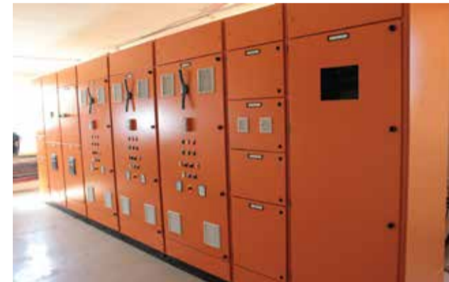
Operating system of the plant.