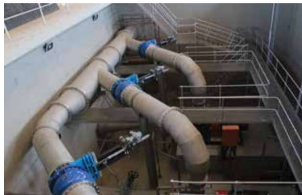
New pipes installed at the Boskrans Water Treatment Plant.