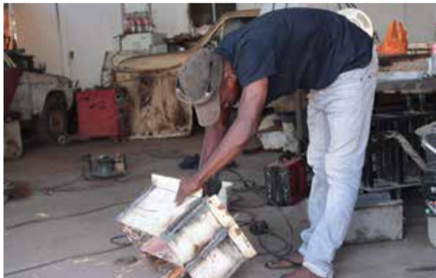
One of the workers at his workshop at the industrial sites the municipality allocated for businesses.

The purpose was also to address old infrastructure and the low water pressure in Mhluzi Extension five, six, seven and Middelburg Extension 23. This is where the replacement of asbestos water pipes with PVC pipes and the construction of an elevated water tank are almost complete.