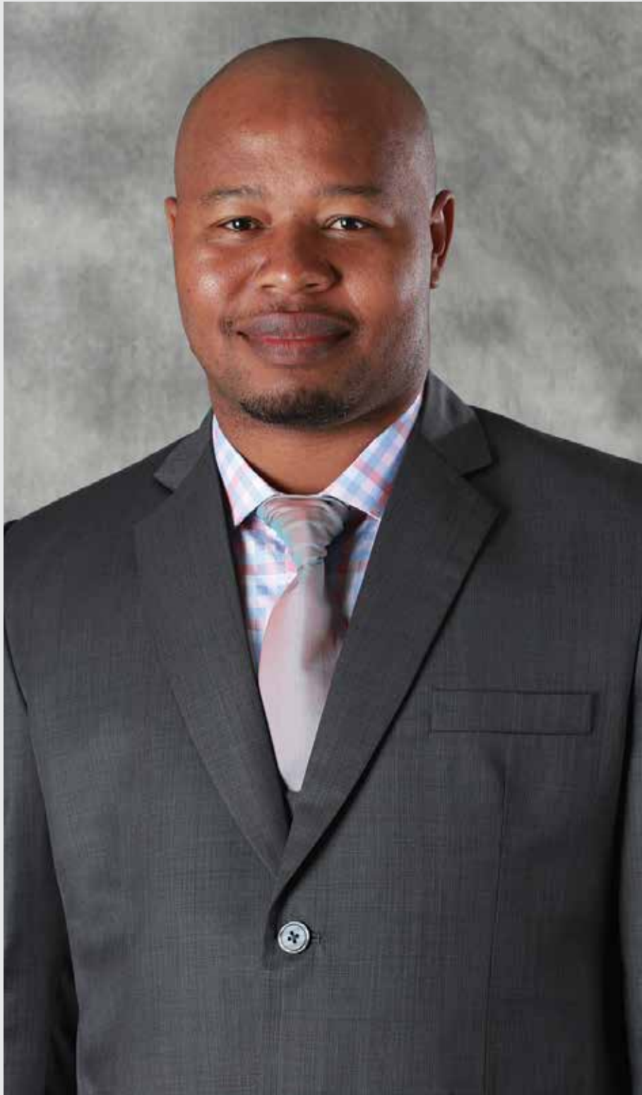
MEC for Finance, Economic Development and Tourism, Vusi Mkhathshwa.

The province has created 19 649 jobs through the Expanded Public Works Programme. The main beneficiaries of these opportunities were: 12 254 women, 9 239 young people and 159 people with disabilities.