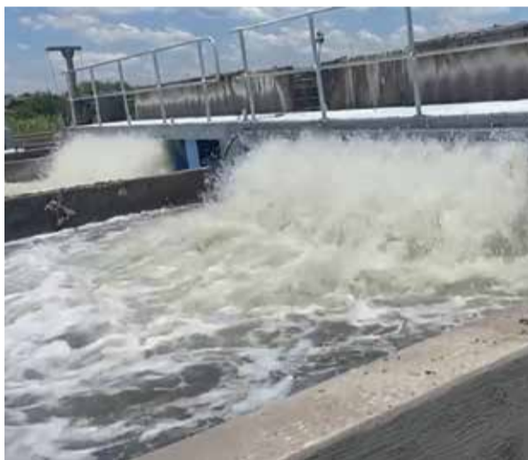
New aerators installed and the stench is no longer there.