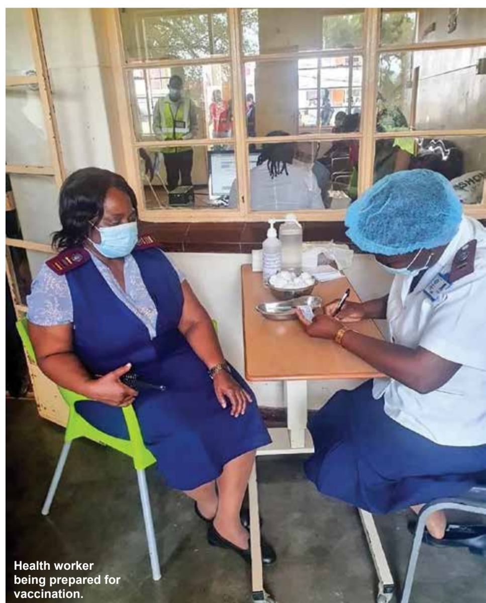
Health worker being prepared for vaccination.