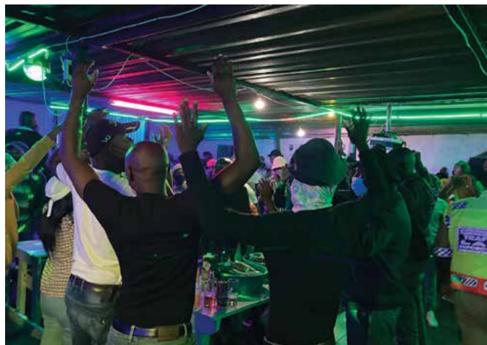
Hands in the air as the police search the patrons.