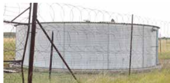
Small reservoir at the Sikhululwe Village.