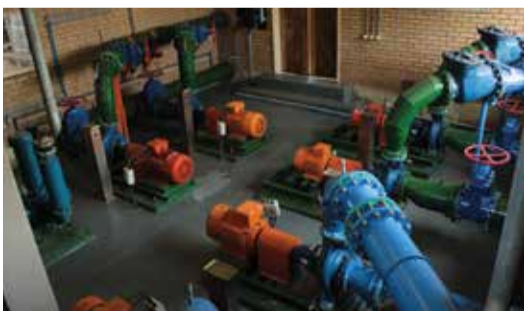
Refurbished pipes inside the plant at Optimum Coal Water Reclamation Plant.