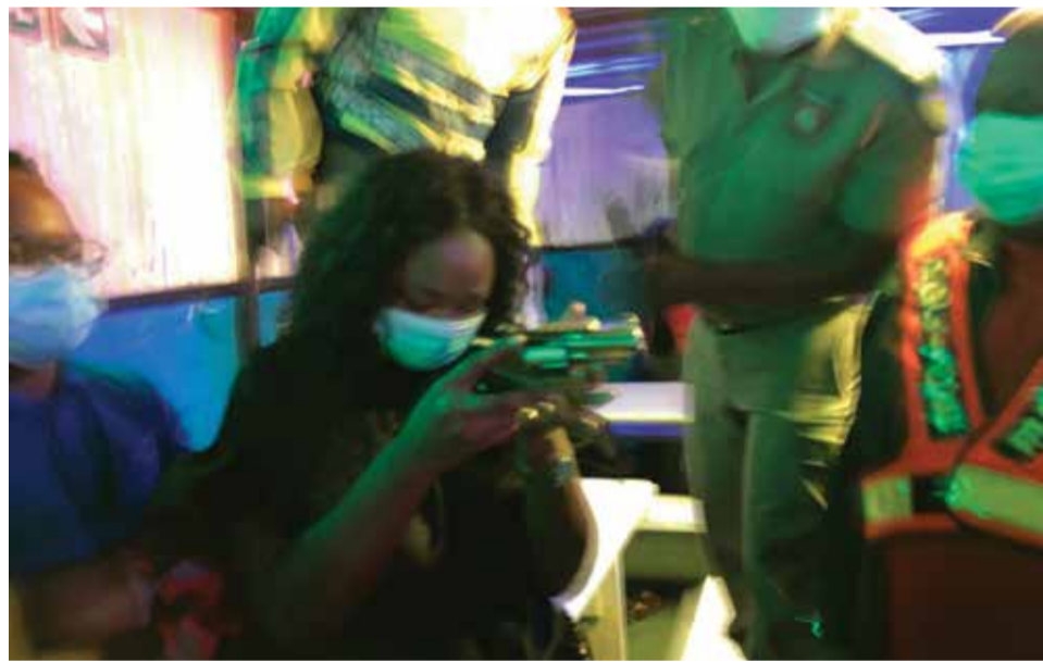
A female brandishing a toy gun she was found in possession of.