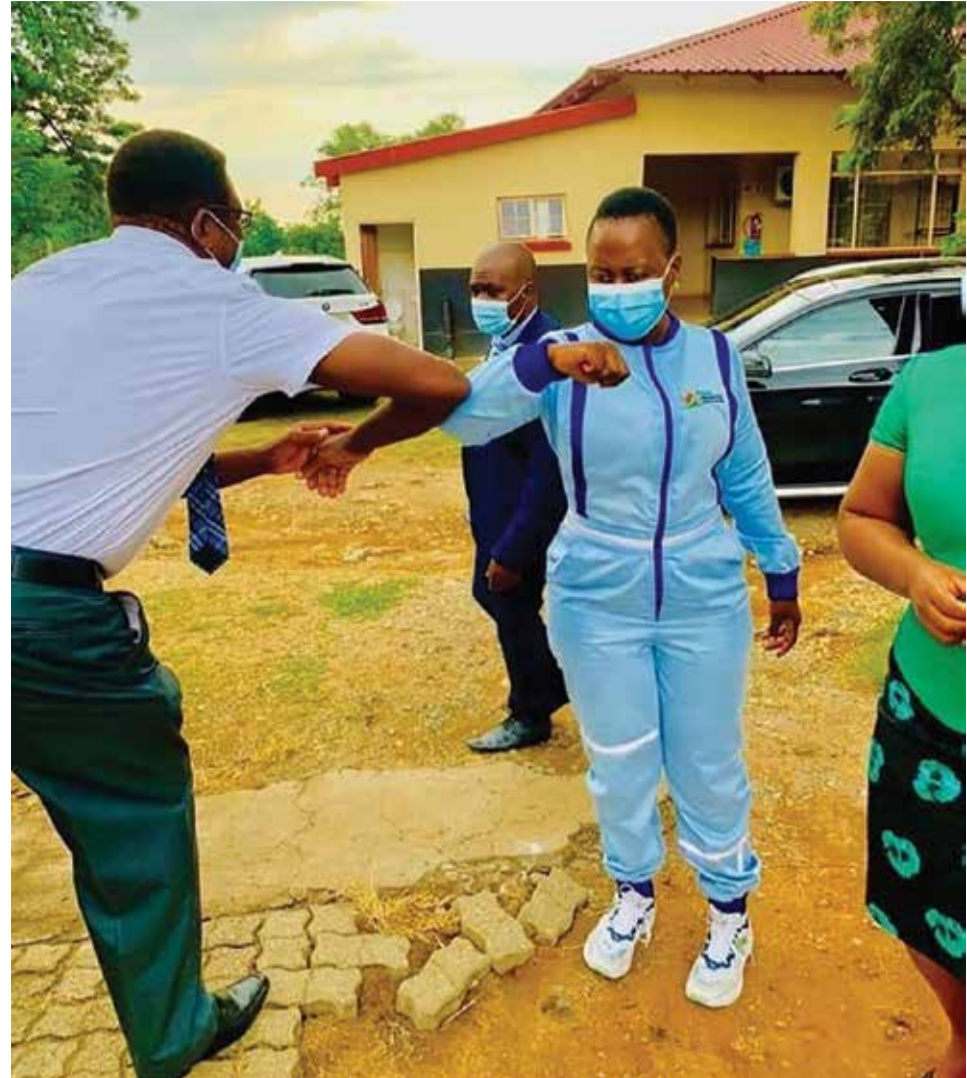
MEC for Health, Sasekani Manzini greeting the new normal.