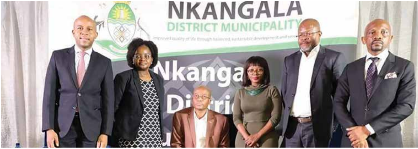
The Nkangala Economic Development Agency board members.