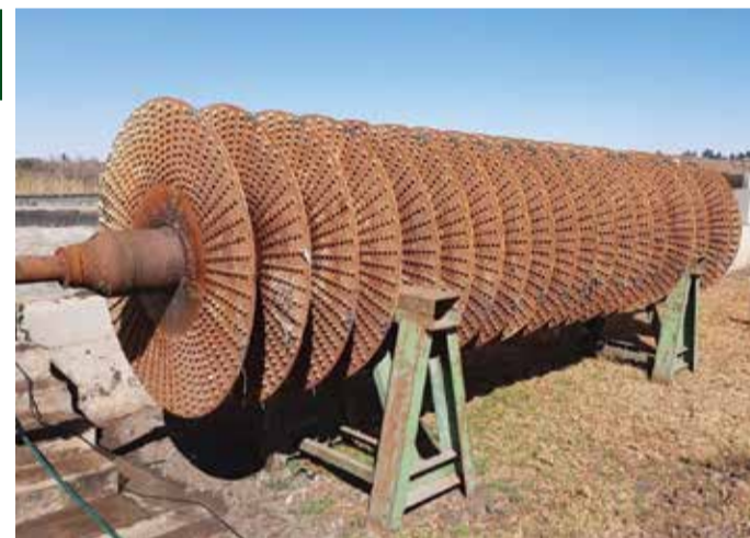
Pictured is an old aerator that was removed that caused the stench residents were complaining of.