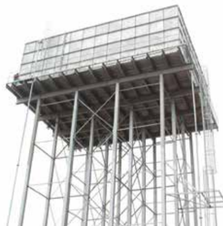
Newly constructed elevated reservoir.