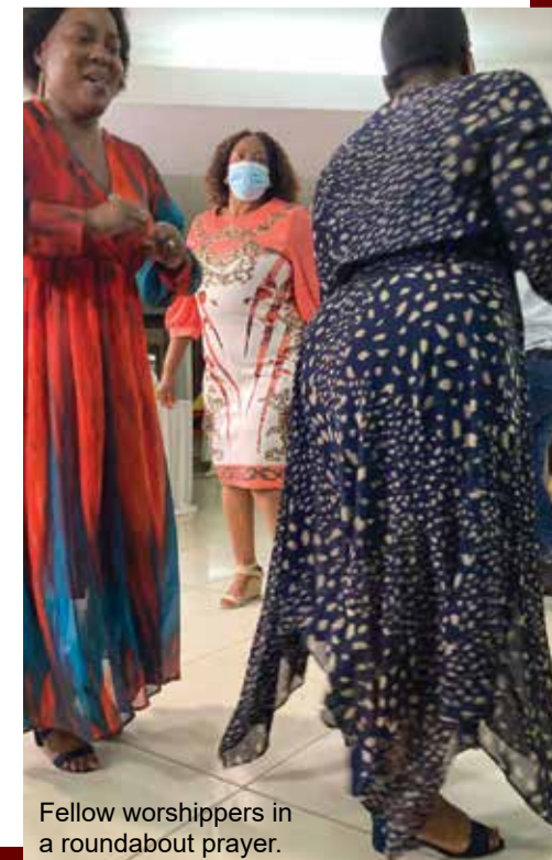
Fellow worshippers in a roundabout prayer.

"Those who will be travelling long distances, drive cautiously because road accidents are fatal and hospitals are full. Observe rules and regulations of the road and make sure you arrive safely," he concluded.