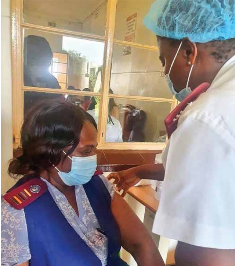
Health worker taking the vaccine.