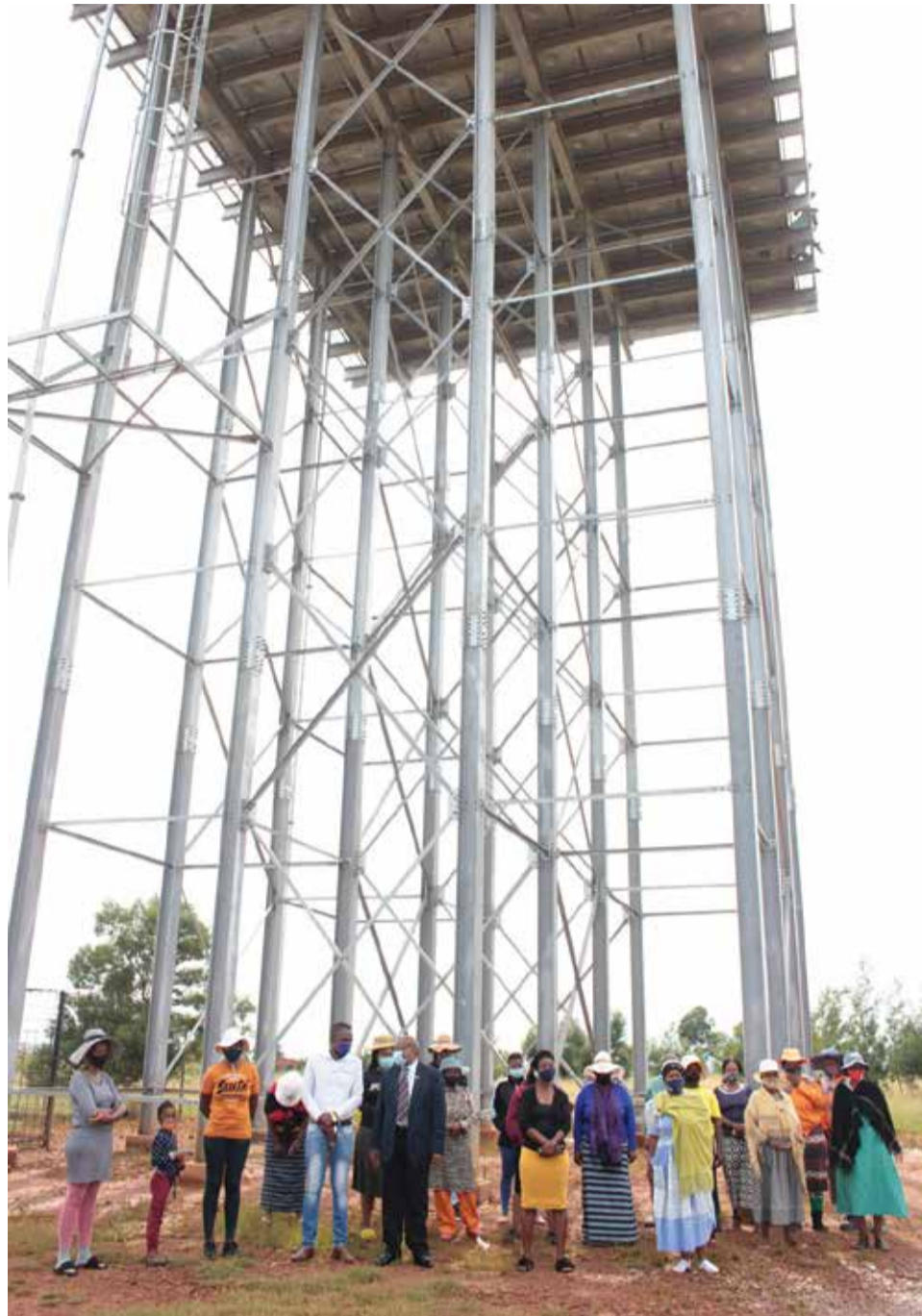
Mayor stands poses with community members close to the newly built elevated reservoir at Somaphepha Village.