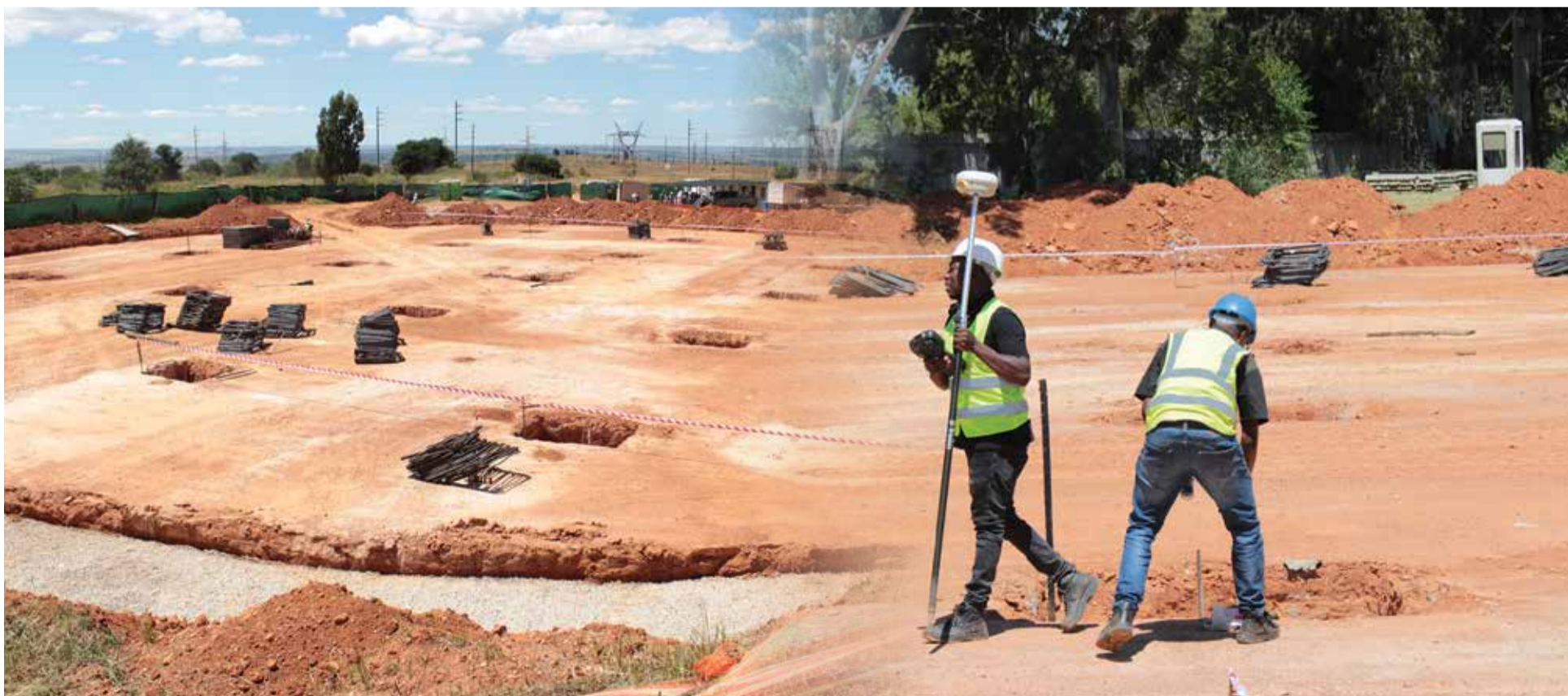
Workers on construction of a 15 mega litre reservoir at the Graspan water project.